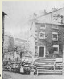
'Elephant Inn' Pub, Stricklandgate, Kendal