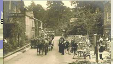
Ran the Milcrest Hotel in Glenridding